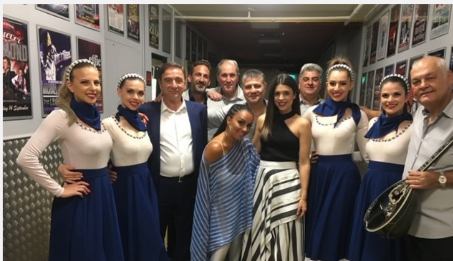
The cast of the show backstage