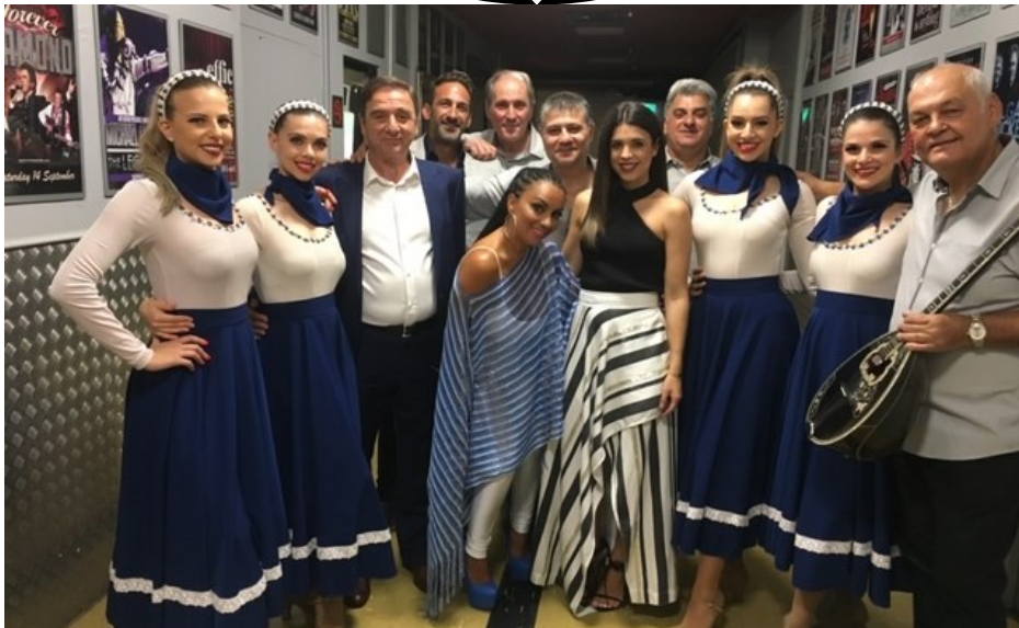
It's all about those smiles!