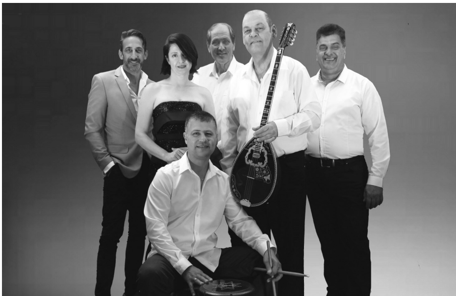
Paradise Band 2018

www.facebook.com/ ParadiseBandAustralia/