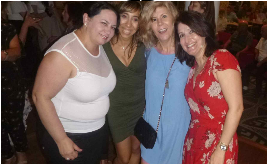
It's all about those smiles!