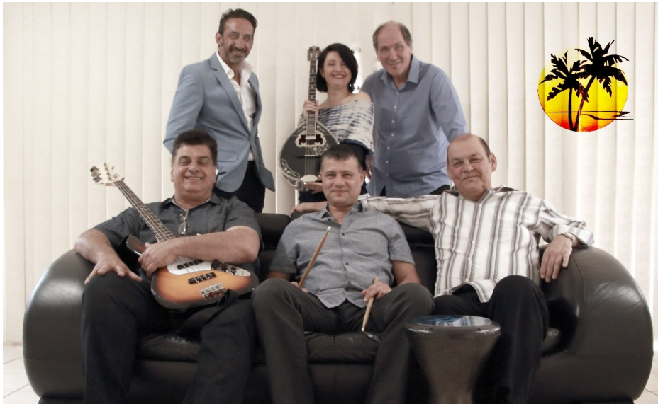
Paradise Band 2018